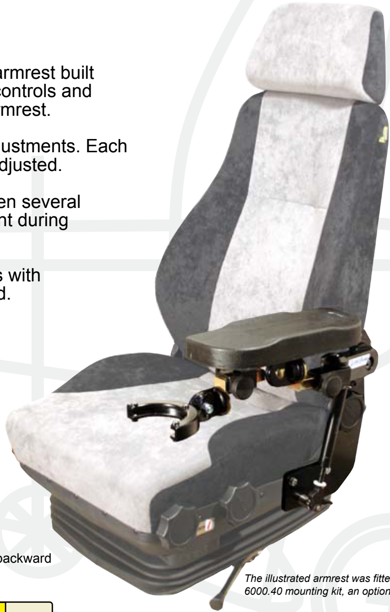
The illustrated armrest was fitted using 6000.40 mounting kit, an optional extra.