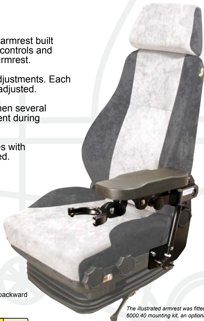
The illustrated armrest was fitted using 6000.40 mounting kit, an optional extra.